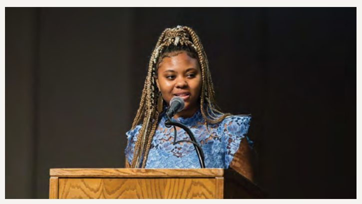
313,147 Service Hours