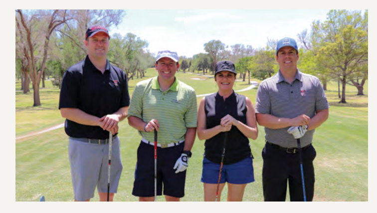
$43,185 Money Raised

Every year, the Volunteer Center of Lubbock holds an invitational golf tournament to allow business partners to help support our impact and have fun doing it! The 15th Annual Post-Masters Invitational, held at the Lubbock Country Club, was an abosulte success.