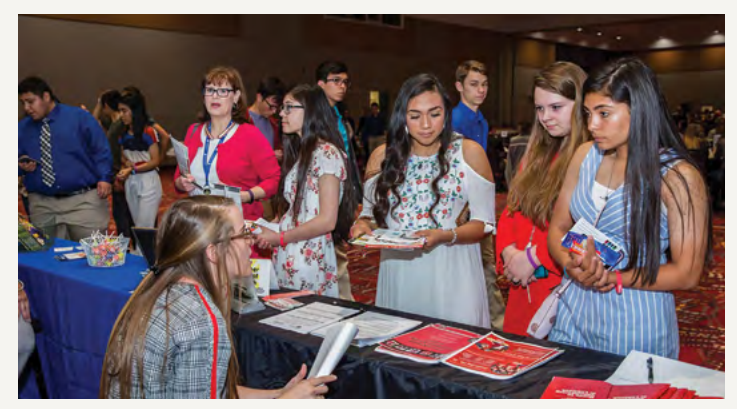
3,725.5 Leadership Training Hours