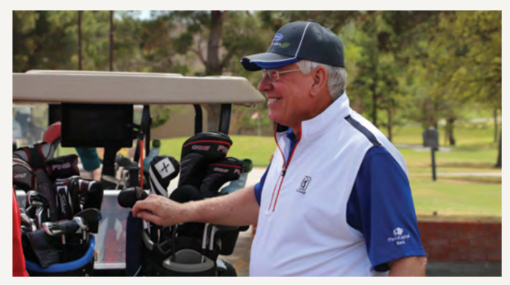
22 Golf Teams

Thank you to our golf teams and tournament sponsors for contributing to our impact!