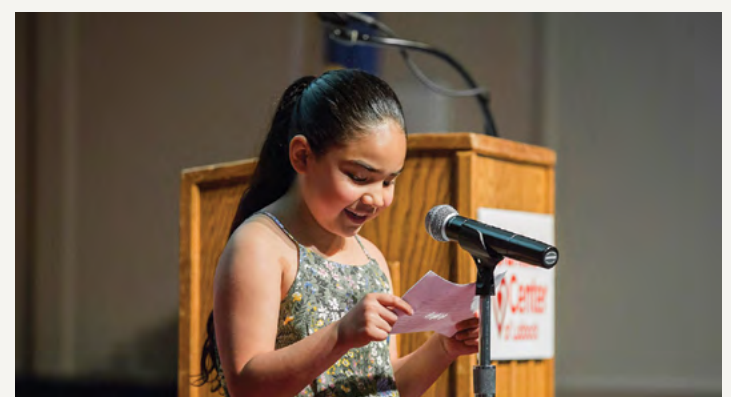
17,585 South Plains Area Youth who gave back to their community through a Volunteer Center program

Celebration of Service is an annual event that honors local youth that have volunteered their time to serve our community, including students from Lubbock HYPE, Youth In Service, United Way Youth Division, and From the Heart. The following statistics are from the 2019-2020 school year.