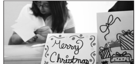
Groups & Family Volunteerism

Be a part of the Volunteer Center's Community Engagement efforts!