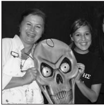
Building a Spook House at Lubbock Boys & Girls Clubs