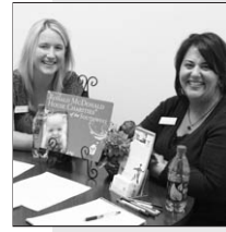
Ronald McDonald House

Attendance to the Invested Intern workshop is a prerequisite for agencies to participate in the fair. Visit our website for upcoming dates and details.