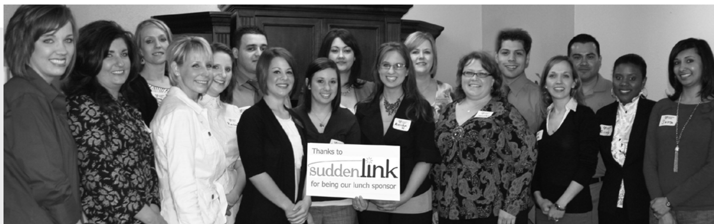
Emerging Leaders 2011

Besides our leadership development programs, we offer a number of workshops throughout the year!