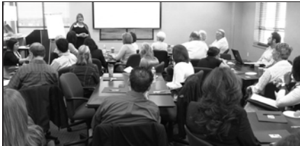
Workshops & Consultations