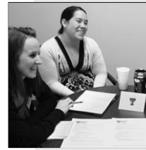
Volunteer Ctr of Lubbock