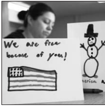
Making Holiday Cards for Soldiers at the VCL

More National Days of Service to come in 2012! Your help is always needed. Contact us for details.