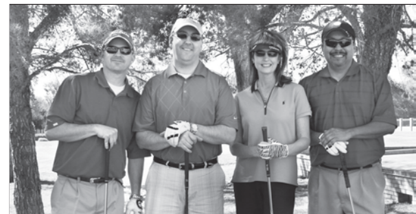
Atmos Energy Team. April 2011. 7th Annual Golf Tournament

Opportunities are available. Contact the Volunteer Center for more information on sponsorship benefits to get your business involved.