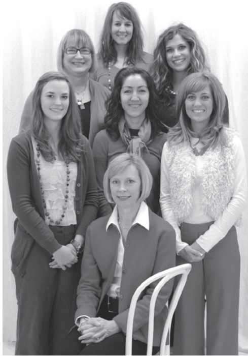
Thanks to Portrait Innovations for taking this wonderful picture of our staff! Find them at portraitinnovations.com or at Kingsgate Center, 82nd & Quaker, Lubbock TX

From all of us at the Volunteer Center, thank you for your support during 2011!