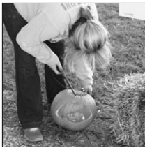
Helping with Pumpkin Walk at the Arboretum