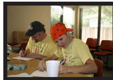
Above: Volunteers sign cards for those stationed at Kunsan Air Base in Korea. These cards were used for Family Volunteer Day. See story below.