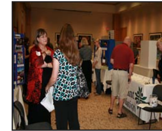
Above: Mixing and mingling at Speed Boarding.