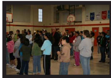
Above: Kick-off rally at Dupre Elementary School.