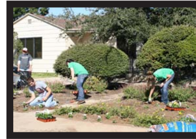
Above: Weeding, planting and mulching on a beautiful October day!

Thanks to all the groups and individuals who turned out for Make a Difference Day on October 25.