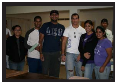
Above: Groups from Texas Tech preparing to paint the basement at Hope Community of Shalom.

Thanks to all the groups and individuals who turned out for Make a Difference Day on October 25.