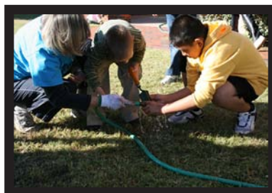
Above: Cleaning up the gardening tools at Dupre Elementary.