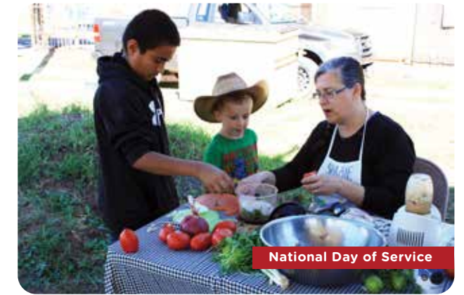
National Day of Service