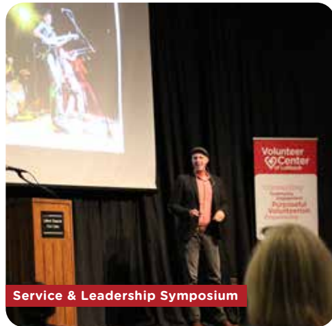
Service & Leadership Symposium