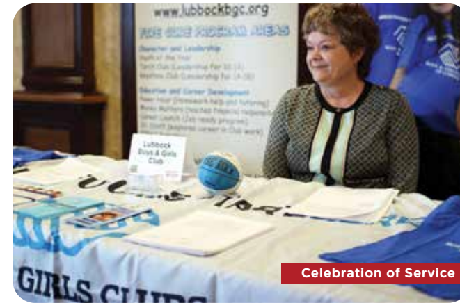
Celebration of Service