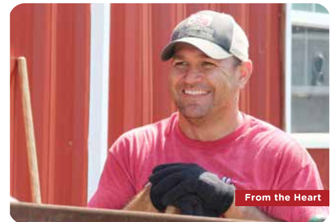
From the Heart