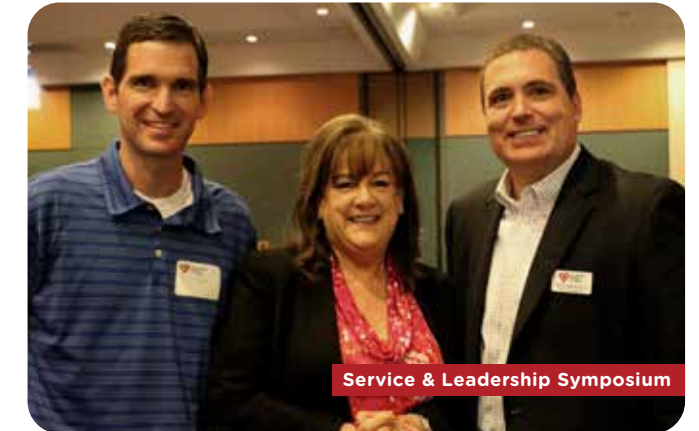
Service & Leadership Symposium