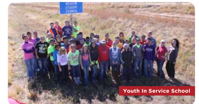
Youth In Service School