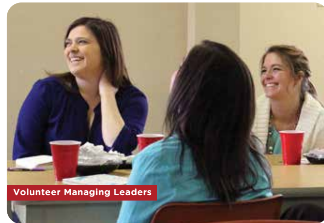
Volunteer Managing Leaders

“THE VOLUNTEER CENTER HAS ALWAYS BEEN AN AGENCY THAT KNOWS WHAT IT’S ABOUT AND GOES FULL STEAM AHEAD. THAT’S HARD NOT TO INVEST IN. I DON’T KNOW ANYBODY ELSE IN TOWN WHO DOES WHAT YOU DO TO THE EXTENT AND THE NATURE THAT YOU DO..YOU ARE UNIQUE.”