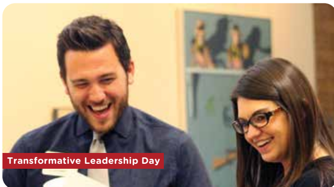
Transformative Leadership Day

“AS A LEADER OF A TEAM, I USE CHARACTER TRAITS I LEARNED ABOUT MYSELF AND LEARNED HOW TO RECOGNIZE TRAITS IN OTHERS IN ORDER TO BUILD A STRONGER TEAM.”