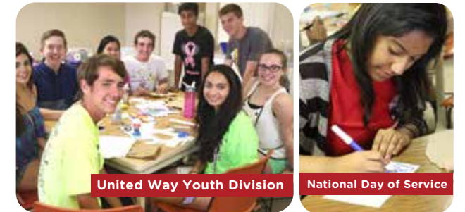
United Way Youth Division