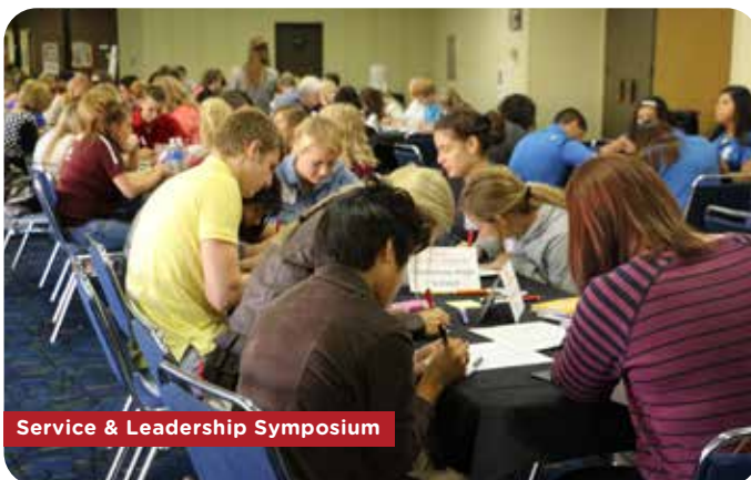
Service & Leadership Symposium